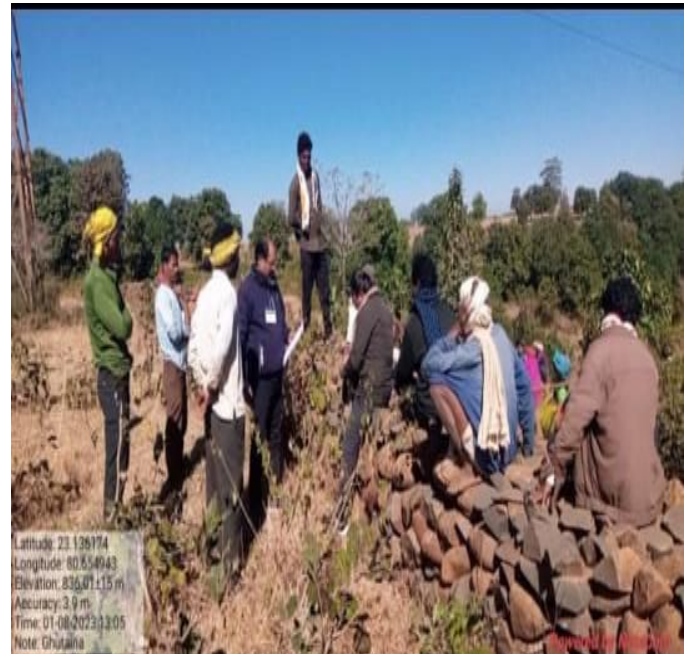
Latitude: 23.126174 Longitude: 80.854943 Elevation: 836.01115 m Accuracy: 3.9 m Time: 01-08-2023 12:05 Note: Ghuraina