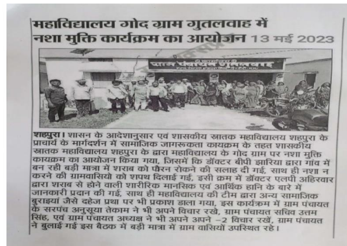
Scanned with OKEN Scanner