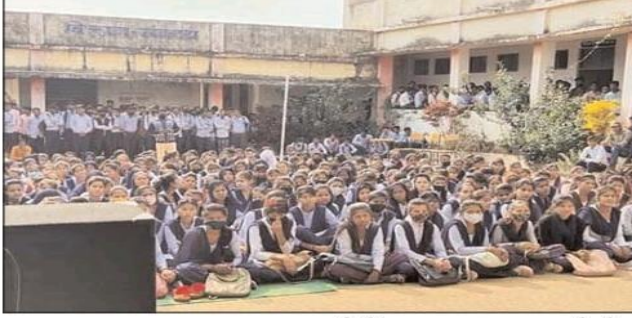
नवप्रदेश, शहपुरा डिण्डौरी