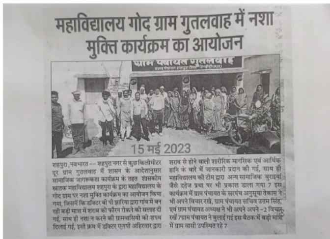
Scanned with OKEN Scanner